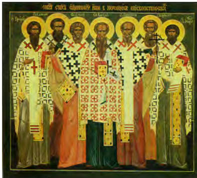
Saints Basil, Ephraim, Eugene, Elpidus, Agathadorus, Aetherius, and Capiton

These seven men knew they had a dangerous job to do. But they knew it was an important one—a job that God had given them. That's why they bravely and joyfully did it.