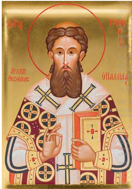
Icon of Saint Gregory Palamas

On March 8th we commemorate: Venerable Theophylactus, Bishop of Nicomedia. Apostle Hermas of the Seventy.